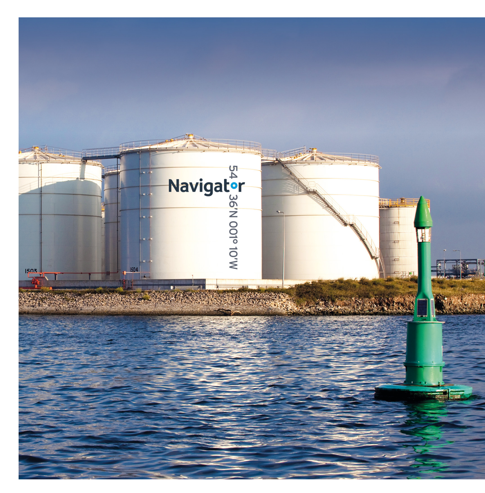
Navigator Terminals UK